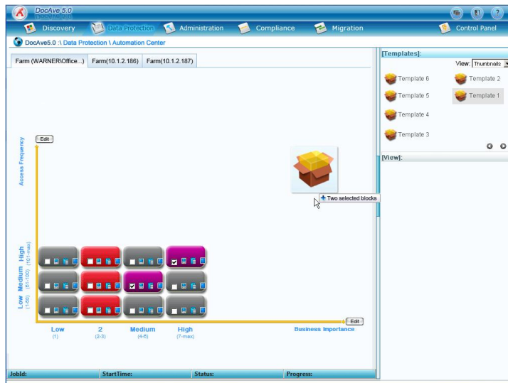
Figure 3: DocAve v5 Backup Criticality Matrix

Using DocAve Backup and Restore , content owners will have the ability to specify business importance for each site, and the software will automatically prescribe each site to the appropriate cell within the matrix based on both business importance and access frequency. Based upon end-user activity, DocAve will automatically adjust each site's placement within the matrix as criticality or activity changes. For each cell, administrators can apply more aggressive backup plans (hourly or daily, for example) to content covered by more aggressive SLA's.